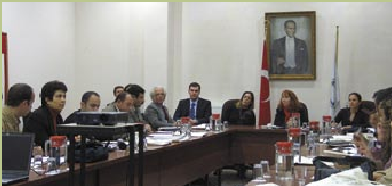
Snapshots during and after the Winners Meeting for the Small Grants Programme