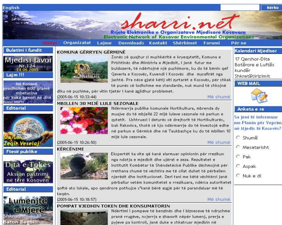
Figure 1 http://www.sharri.net/

After lot of work and efforts, we managed to develop new dynamic web page of Sharri.Net ( www.sharri.net ), that's matches with the criteria's of the Business Plan. We are still adding some new components to the web. With the help of NGO Aquila, web-site now is available in English and soon will be available in to Serbo-Croatian language.