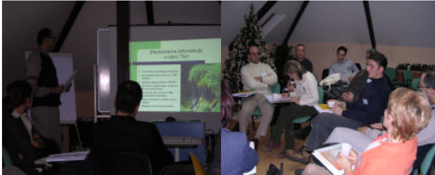
Photos: the third national meeting (left), and a presentation of the Tara working group

Results of the working groups will be incorporated into the action plan for 2005.