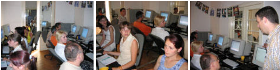
Photos: advanced computer training course

Within the framework of project, Volvox organised an advanced computer training course from July 6-9, 2004 for members of the Environmental NGO Electronic Network in Serbia and Montenegro. The course drew more than 20 representatives from NGOs involved in the Volvox network from Serbia and Montenegro, and who will now be able to implement knowledge they gained in advanced Word, Excel, PowerPoint and Internet publishing skills in their further network activities.