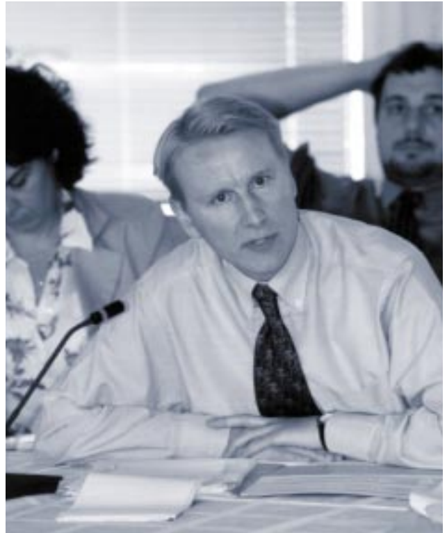
JARI HAAPALA, DG Enlargement, outlines general issues of the PHARE Programme and details of the Access programme as a new funding tool for NGOs.

In addition, the Programme includes also a Networking Facility, which will provide support for the NGOs/NPOs in the candidate countries to participate in activities organised at EU level. The Facility will mainly cover travel and subsistence costs for attendance at events organised by bodies, such as the EU-wide NGO/NPO platforms. The programme will be locally managed — by Commission Delegations — in the candidate countries. Each Delegation will launch one or more Calls for Proposals in year 2000. The Delegations will also evaluate and select projects for funding, conclude contracts and follow up the projects throughout their implementation.